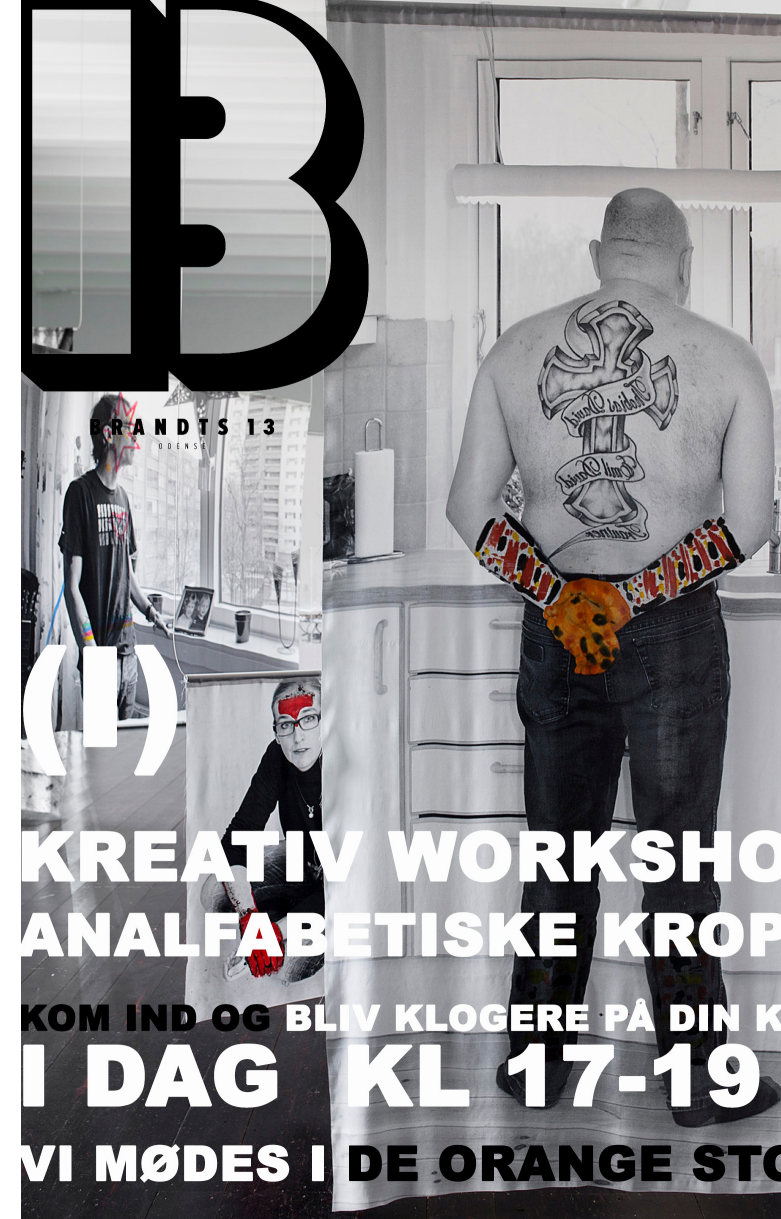
(I) Exhibition and workshops (2016-2019)

Photographs on silk satin with painted pain visualisations, made with chronic pain patients. I won the 15th of June Foundation's Honorary Award and the Sven Dalsgaards Honorary Award for the project, which was judged one of the three best graduation projects from the Danish art academies in 2016.