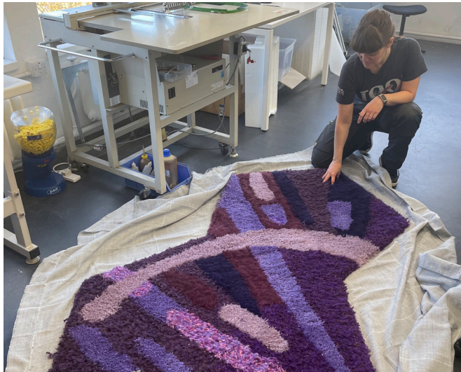
Aura In process rug tapestry installation visualising a purple migraine aura, 2023

Sacks (2012) observes that migraines through time have been accompanied by hallucinations: visual auras, which are form constants. Unlike the subjective experience of the headache, these auras follow a universal pattern that adheres to one of three general categories: phosphenes, scotomas or cortical waves.