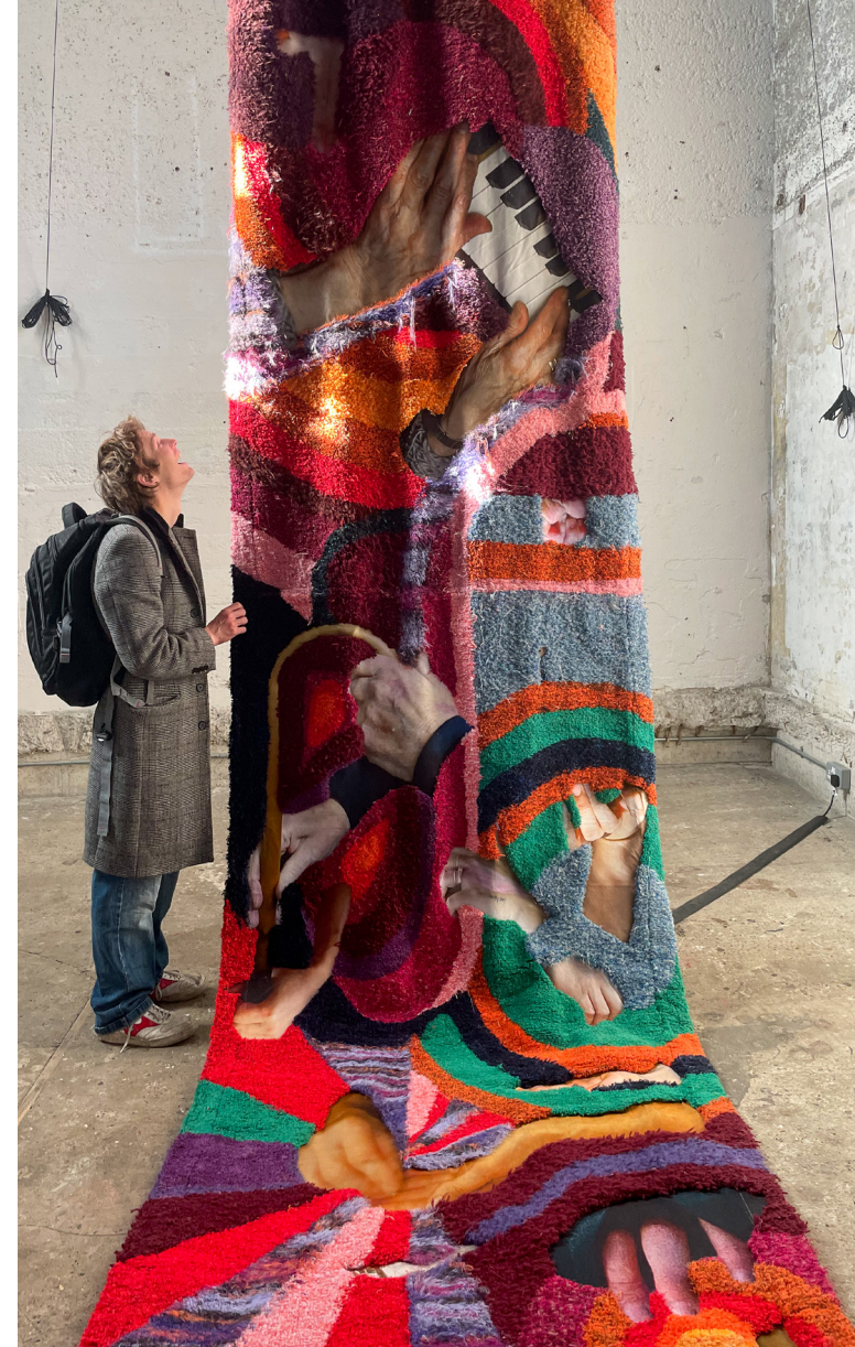
Touch Southwark Park Galleries, London, March 2022

"C-tactile favorable touch provides a non-verbal method of communicating social support and results in reduced pain sensitivity." (Taneja et al., 2021)