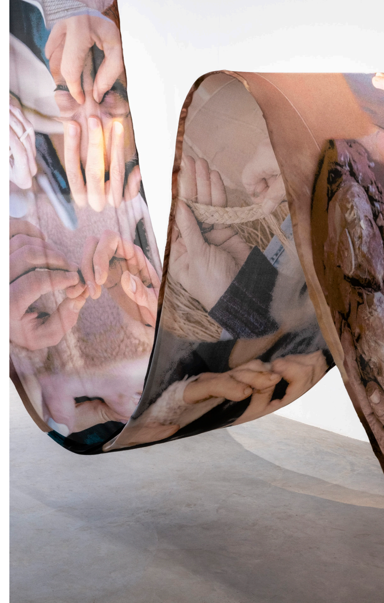
Intimation Ses12Naus, Ibiza, April 2022

Touch is the first sense that we develop. It is an incredibly nuanced and varied sense that can mean something different to all of us. With touch, we can move from inconsequential to salient in an instant. There are many qualities and emotions connected to touch, and it can be both comforting, uncomfortable, intimate and connecting. It is closely linked to emotions and pain. The reciprocity of touch is always up for debate and cannot be assumed symmetrical.