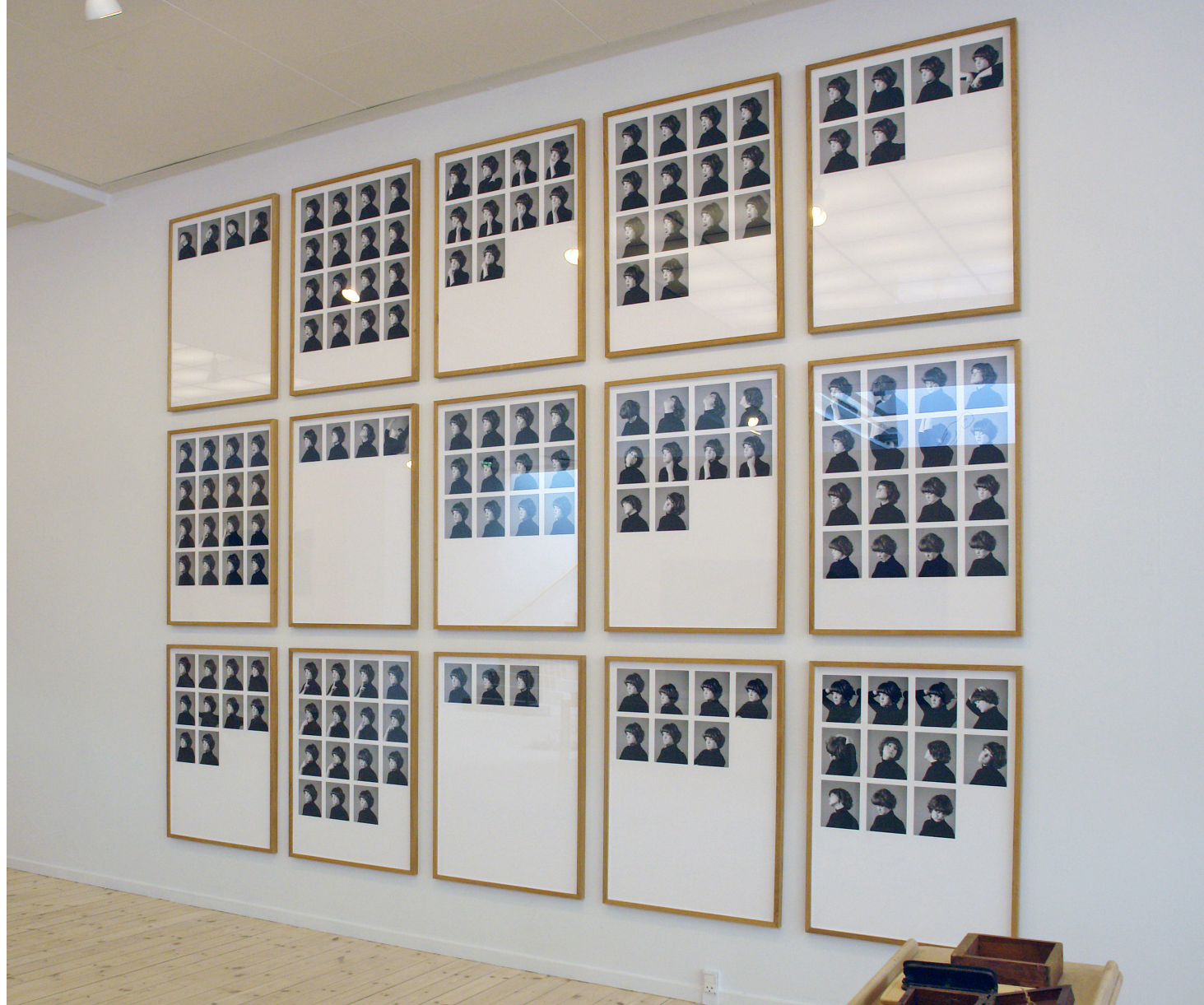
Release - Grid #1-15 Photographic grids 100x70 cm - KP20, Kunsthall Aarhus, April 2021

A series of paintings, photographic grids, performances and videos. I translate exercises for chronic headaches into materials that speak openly about the body and its functions. The work becomes a visualisation that is inseparably bound up with the real without resembling it; abstractions of lived life.