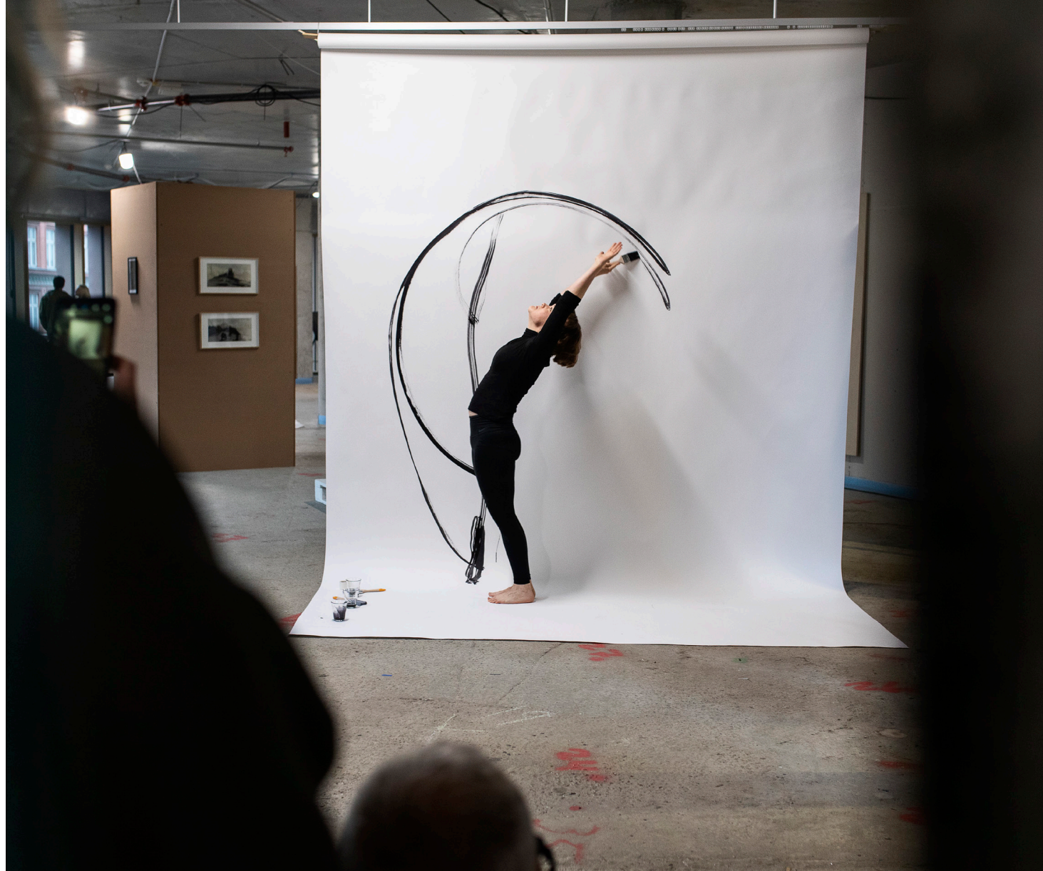
Release - Performance Performance of painting a release painting at Copenhagen Art Week (2019)

Release has been exhibited in different constellations; at The Language Hospital at Sorø Art Museum, Copenhagen Art Week, Kuldiga Art Hall in Latvia, BKF in Copenhagen, Travers Smith in London and the publications The Pluralist, UK and Der Grief Guest-Room curated by Dominic Bell, Germany.